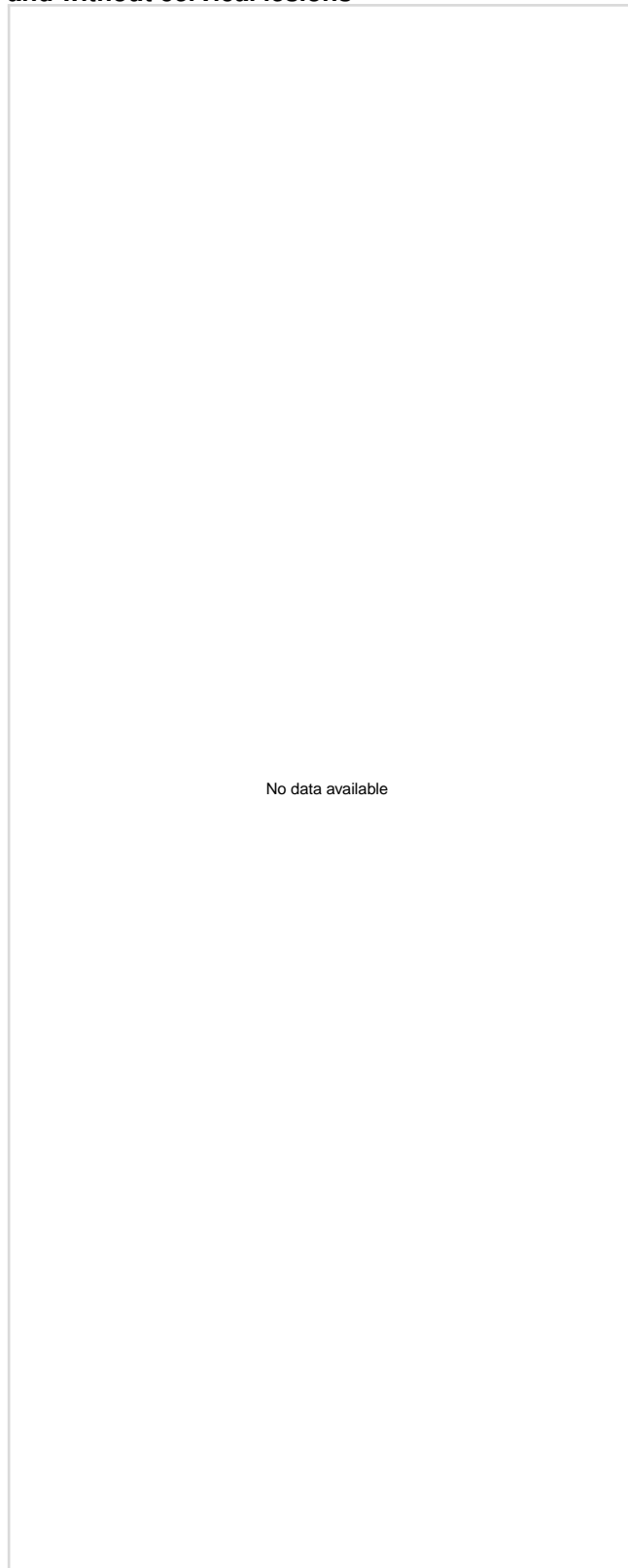
Figure 1. Comparison of the ten most frequent HPV oncogenic types in Uzbekistan among women with and without cervical lesions